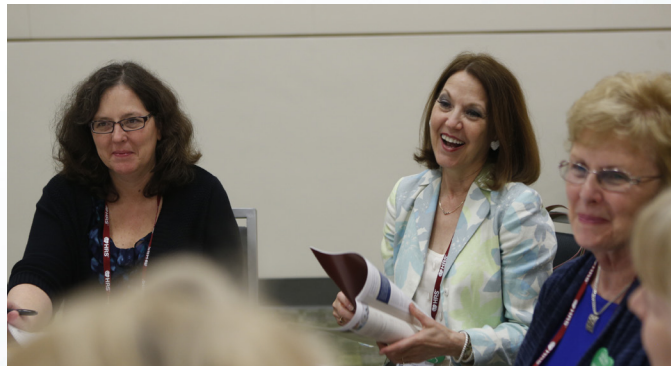
IBHRE CCDS/CEPS Lounge at Heart Rhythm 2014