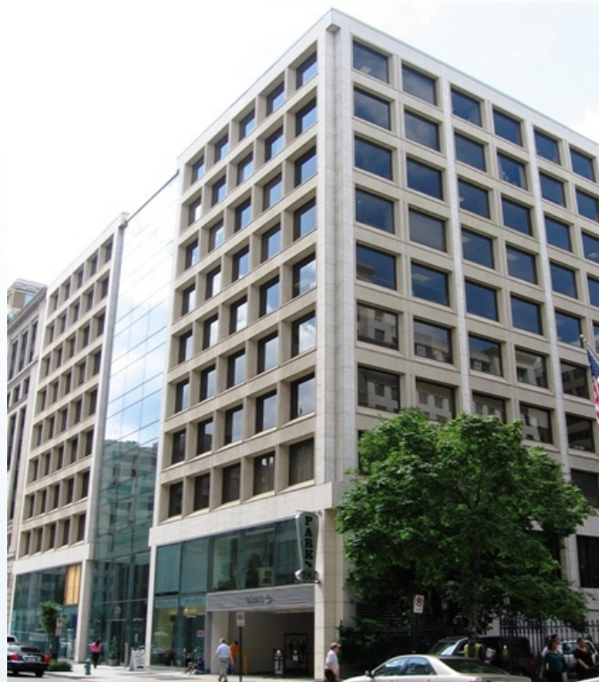
1325 G St NW, Washington DC

The space was designed specifically for HRS and IBHRE and incorporates the most advanced technology and green initiatives to better serve our clients and staff. The office has been transformed into a bright, modern space that incorporates contemporary design with unique features.