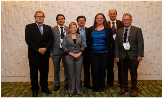
IBHRE Content Experts Committee