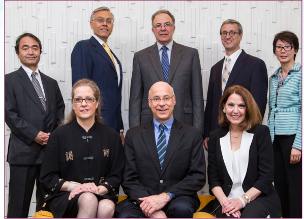
IBHRE Board of Directors