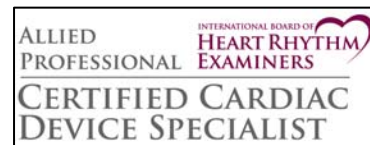
Business Card Logo