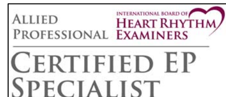
Business Card Logo